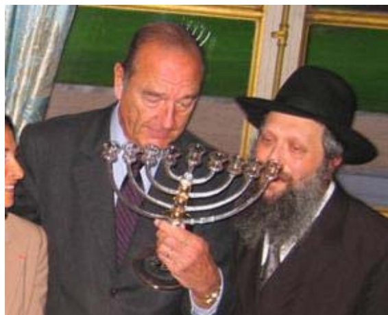
France - President Jacques Chirac